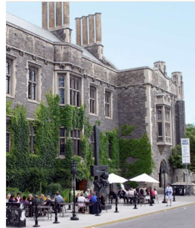
Hart House is a cultural and recreational escape for students, offering athletic facilities, clubs and a theatre. General membership to Hart House is included in your incidental fees. For more information, visit www.harthouse.utoronto.ca

Student Housing Service: http://www.housing.utoronto.ca